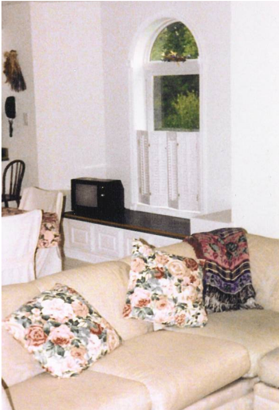
VIEW FROM FAMILY ROOM TOWARDS BREAKFAST NOOK AND WINDOW SEAT