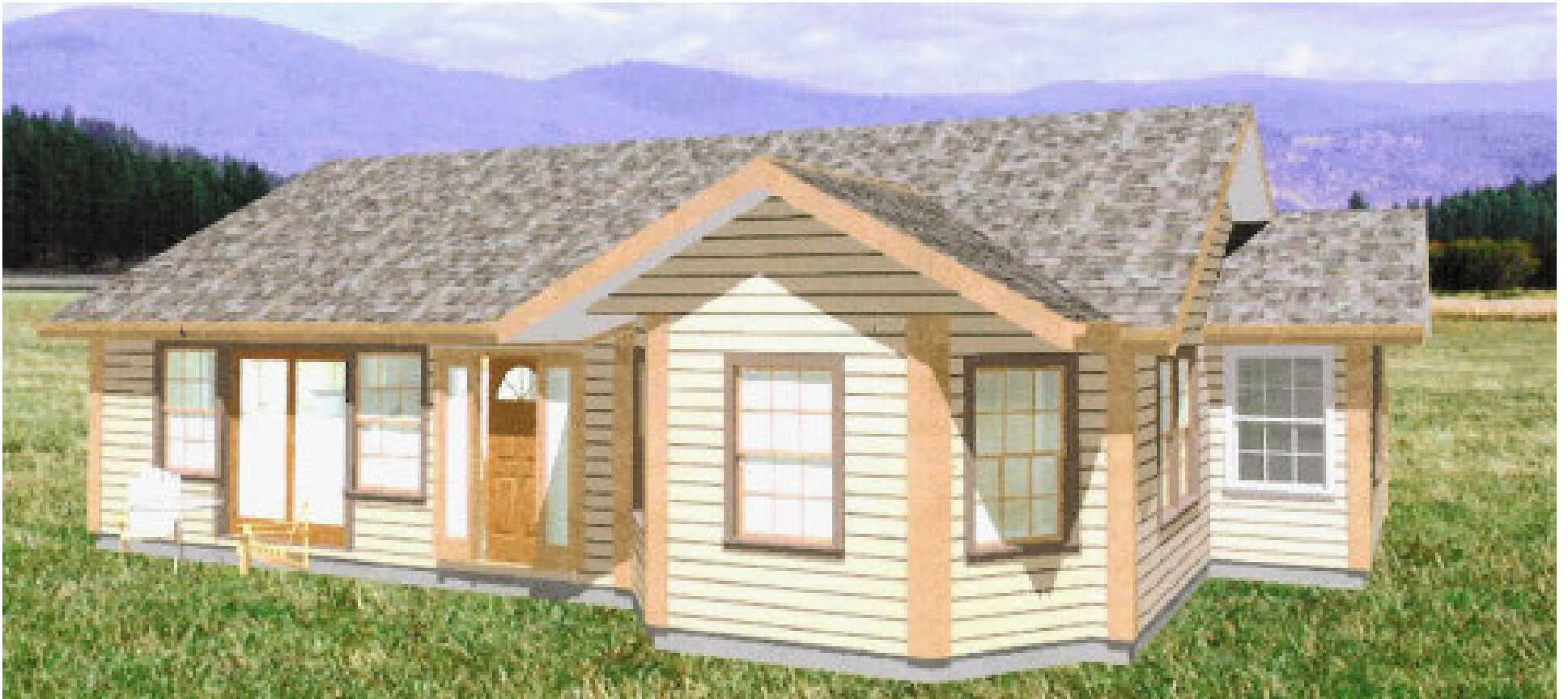
EXTERIOR 3D OVERVIEW